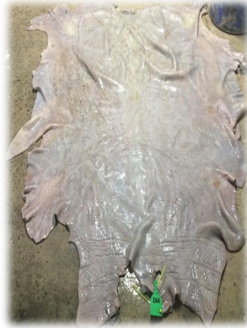
Figure 4. Individually identified blue-chrome hide.

Hide damage. No difference in hide damage or value occurred between left sides (manually extracted) and right sides (grubs allowed to remain) of the cattle. Hide damage observed in feeder calves resolved during the finishing period and all grub-damaged hides met #1 criteria (Figure 4).