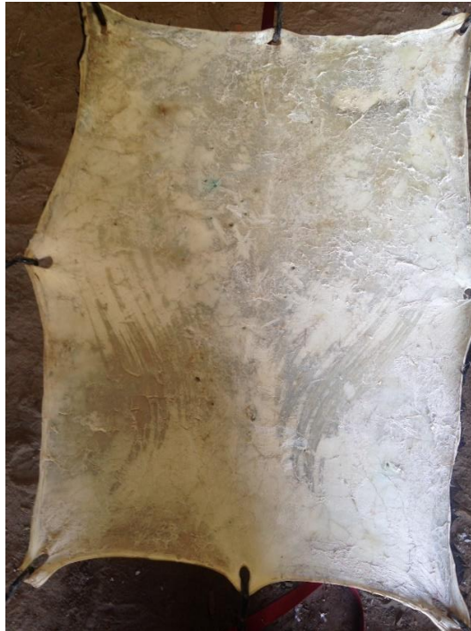
Figure 3. Cattle grub damage in rawhide from a feeder calf harvested at the WTAMU Meat Laboratory (d 18).

Statistical analysis. The primary outcome variable of interest was the subjective ordinal hidegrade score. Secondary outcome variables were interval scale live animal growth and both interval and ordinal carcass grading outcomes. Because the case study was unbalanced (grub infested=23; grub-free=5) and because the assumptions of ANOVA (independence, normal distribution, and homogeneity of variances) were not met, the data were analyzed using nonparametric methods. The Mann-Whitney U test was chosen to analyze the data because they were represented as two independent samples. Median and quartile deviation for each variable were determined via the UNIVARIATE procedure of SAS (version 9.4; SAS Institute, Cary, NC).